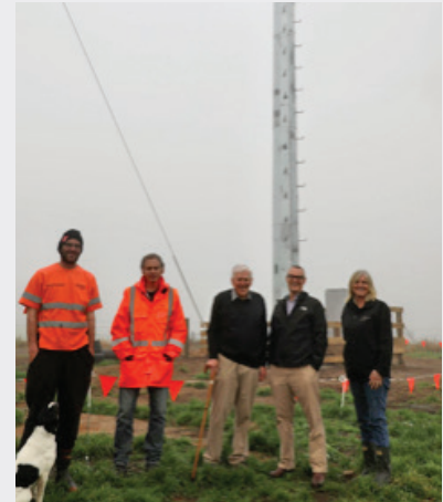
RCG's 150th site, Tongaporutu in Taranaki.