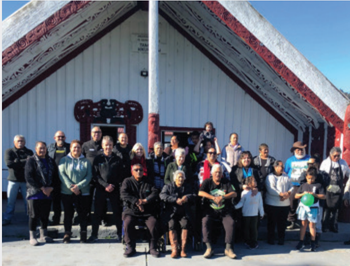
The whanau of Waiohau pose with manuhiri in front of Tama ki Hikurangi following the pōhiri to celebrate the switching on of the RCG tower.

RCG's work around Aotearoa has our team meeting a lot of rural people, working in interesting places. We very much enjoy engaging with landowners, hapū representatives, archaeologists, Heritage NZ and DoC staff about site locations.