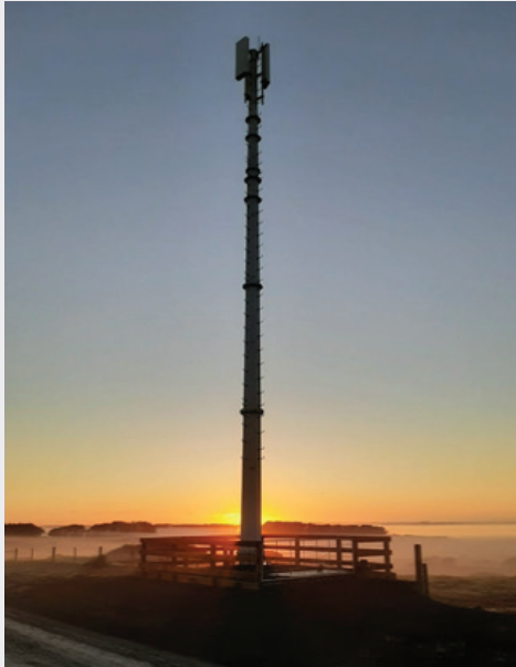
Sunrise at the newly stood pole - Henga